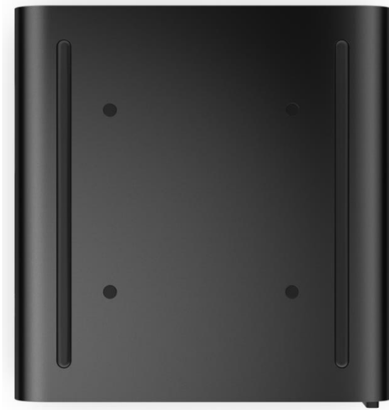
HP Z2 G9 Mini Workstation Desktop PC, bottom view

Removable VESA cap for access to integrated VESA mounting holes